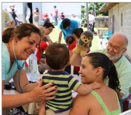
Medical Clinic Volunteers in El Castillo, Nicaragua